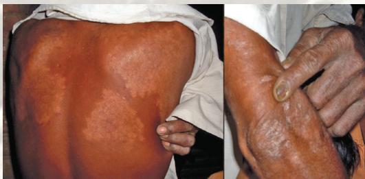
Thousands of Indian farm workers get rashes and reactions from Bt cotton.

A study in Canada found Bt-toxin and herbicide residues from GM crops in the blood of women and fetuses.